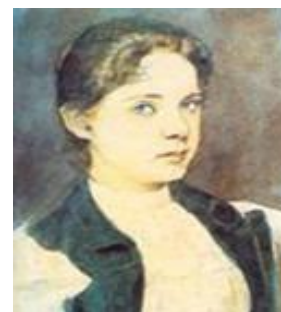
Slava Raškaj (1877 - 1906)